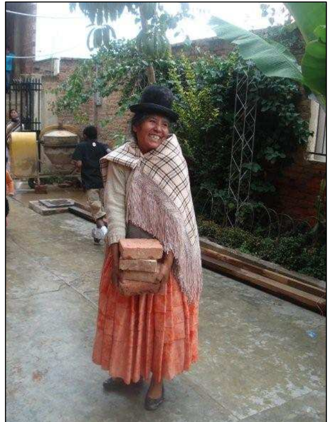
Moving bricks for the new addition to our local church

Since January, Diane and I have been continuing our Spanish classes 2 days a week, as we get more heavily involved in ministry responsibilities as well. One of our priorities is leadership training in the area of Integral Mission: helping local churches to be involved both in meeting the practical needs of their communities as well as being involved in ministries of evangelism and discipleship. Many of the Bolivian churches are already running outreach ministries for area children and adult literacy programs, and are looking for more ways to serve their local neighbourhoods.