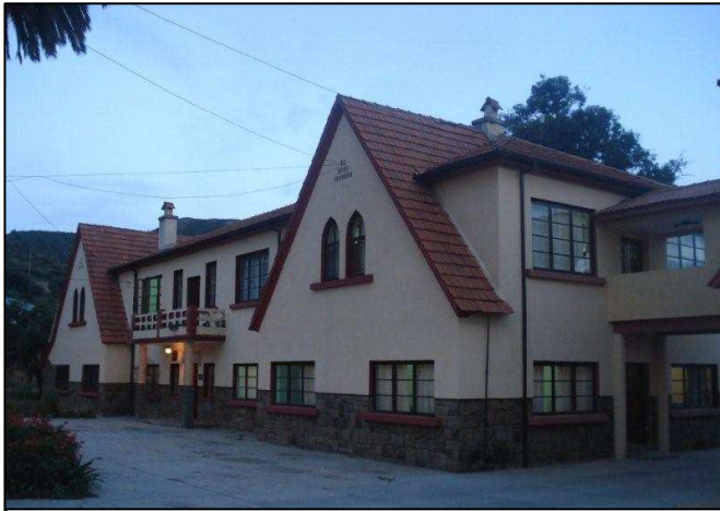
Baptist Seminary in Cochabamba