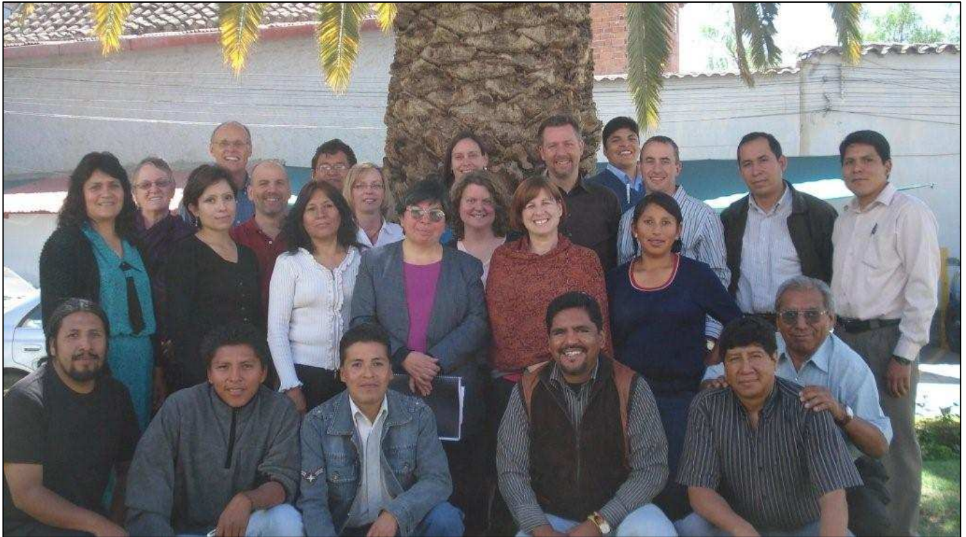
CBM Team Bolivia with staff members of the Bolivian Baptist Union

We feel honoured to be part of such a great team of dedicated servants. (You can find out more information about our team on the CBM website at www.cbmin.org )