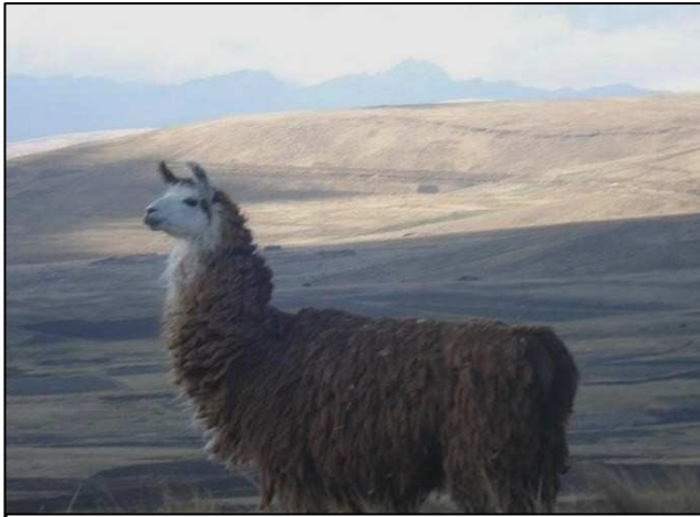
Llama in the Bolivian Highlands (13,000 ft above sea level)