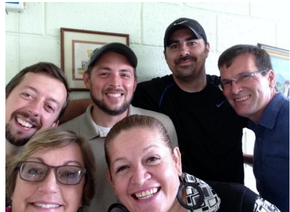
ILE Grammar class colleagues

dedicated teachers and many wonderful fellow students to walk along side us as we managed the challenges of language learning together. We are optimistic that we will be able to become competent Spanish speakers one day!