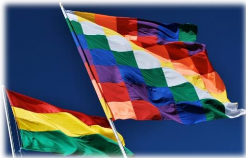
Quick fact: Bolivia has two official national flags

You may have heard of the recent fires raging through the Amazon rainforest. To date over 1.2 million hectares have been destroyed in Bolivia, leaving thousands displaced. This richly biodiverse region has global benefits but undoubtedly those living within its ecosystem will suffer most. This is not a natural process the way wildfires at times occur in Canada but appears to be linked to recent clearing for farmland. Pray for environmental healing for this land and its inhabitants, protection for indigenous groups, and an adequate response in the proceeding months and years.