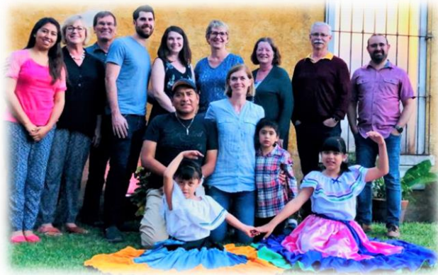
Latin America Field Staff & CBM Office Colleagues