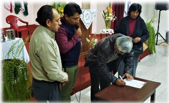
Obades & Nuevo Canaan Church leadership signing their Prayer Partner Agreement

Actively seeking ways to engage Bolivian churches in local ministry is an area of focus we've invested considerable time towards. Mobilizing volunteers not only assists projects but can also reshape how participants understand church, Christian ministry, and their neighbours.