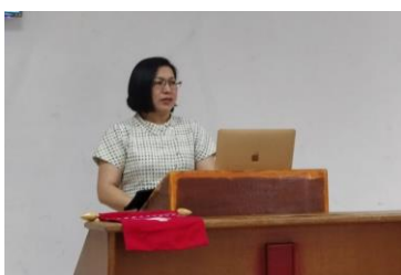
Preaching at Bethel Sunday service

Many students of Bethel who remain in Myanmar can only attend classes online. They shared that a lot of them are not used to this way of studying online. They also have difficulties accessing the internet sometimes because some of them are living in remote places. They can't wait to return to the institute. But it is time for every one of us to put down the desire of going back and putting in our effort to keep moving forward with courage. The important point is that God will carry us on his wings and lead us to new heights where we can have the new sight of the world and reach the further destination. I wish that every one of us won't resist the change, which is uncomfortable for us. We can reach the better goal with God's help. So instead of longing to go back, let's keep moving forward!