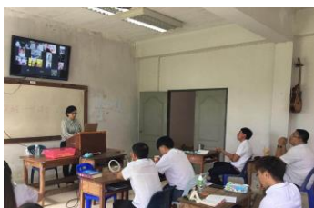
Teaching both in-person and online class

church also resumed Sunday services, but we have to limit the number of attendants by separating the service into Chinese and Thai. I am continuing to teach at TBTI and I'm also involved in preaching and teaching at local churches. The ministries have continued, but we all know that everything is no longer the same. As the nest of the eagle is stirred up, the young eagles no longer return to the original safe nest. The only thing that we need to do is to try our best to keep moving forward. Our lives and work need to overcome obstacles and move on.