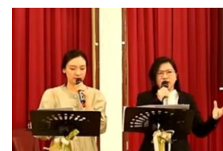
Preaching at Maesai church