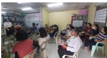
Leading Chinese Bible study