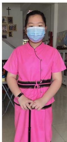
The schools in Thailand have reopened

In the time of COVID-19 outbreak, although there have been great adjustments to our schedules, life and work, I surely believe that God did not let us face this alone without