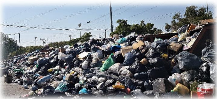
Garbage pickup inhibited by political protests & blockades

Bolivia has experienced some of the highest deaths per capita globally from Covid-19, as many health services have been overwhelmed. Many of our friends and ministry partners have contracted the disease, and sadly, some have succumbed to it.