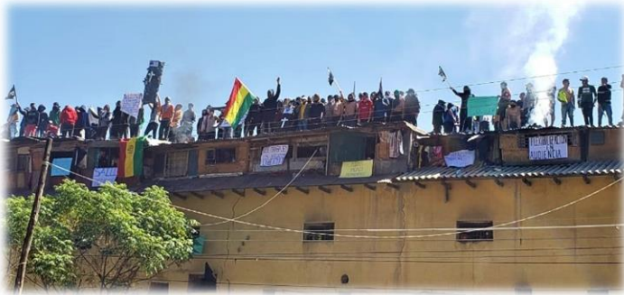
Prisoners on roof protesting lack of medical care as Covid-19 cases & death toll rises in their prison

Bolivia appears to be slowly resurfacing after six months under strict regulations. March to May saw extreme measures which only allowed citizens out of their homes one day a week for 4 hours. June opened up, allowing for vehicle use and two outings a week; however, July went back into strict lockdown including an 11 day full quarantine stretch before returning to the 4 hour a week model. August allowed for two days a week and September is now largely open on weekdays with an evening curfew.